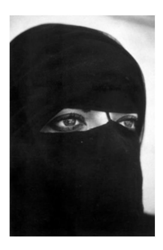
Muslim woman wearing a burkah