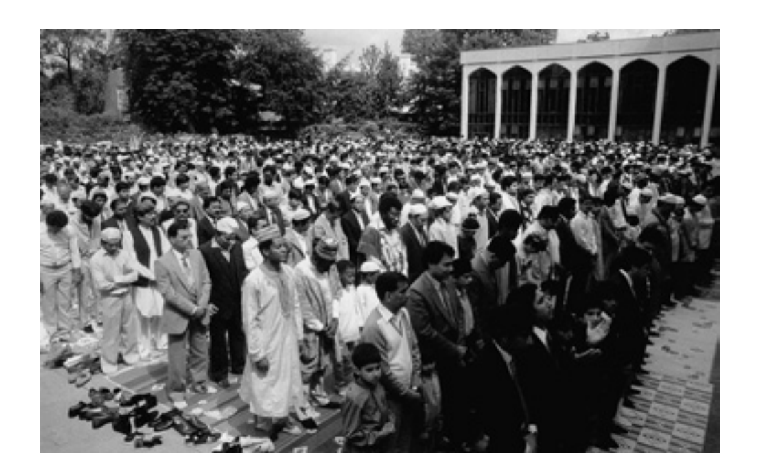
Men and women pray separately in Islam